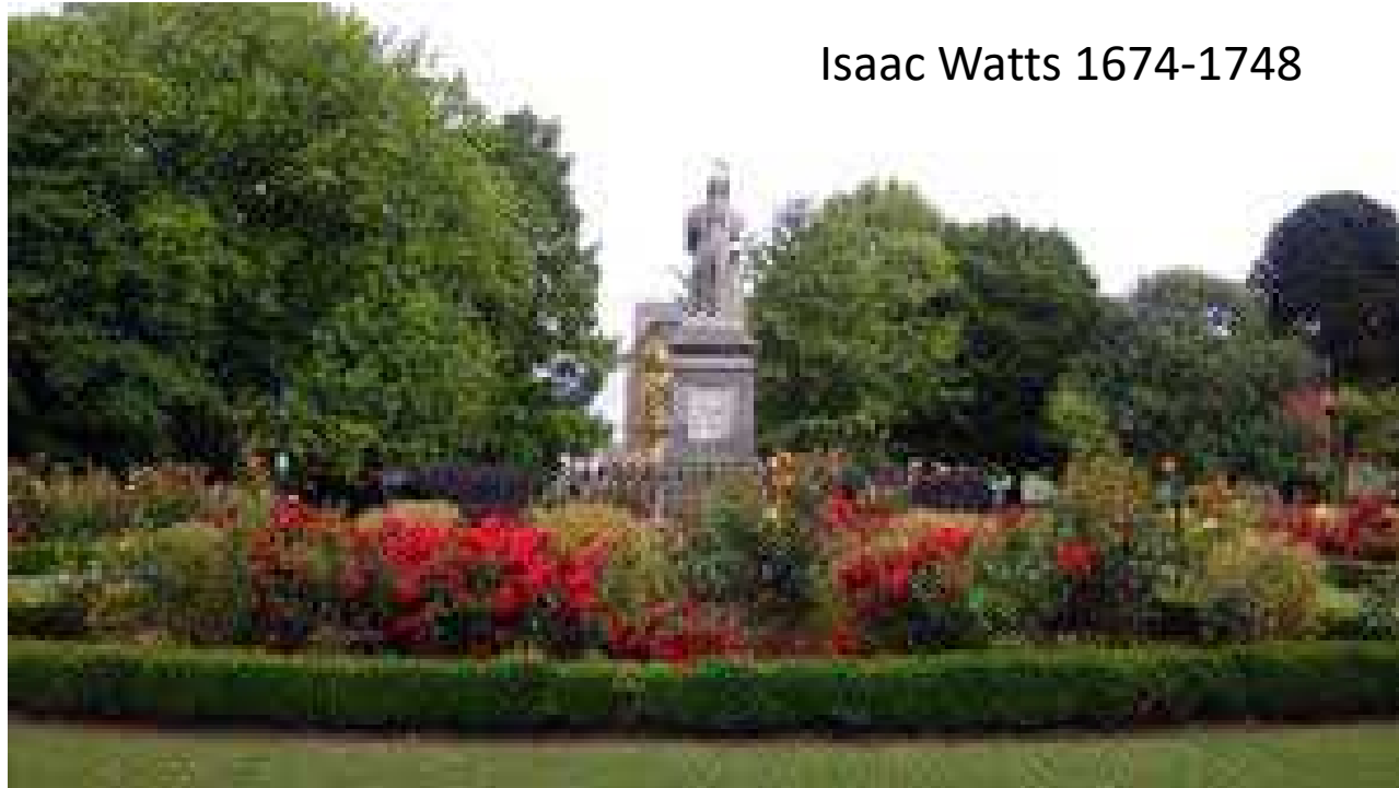
Isaac Watts 1674-1748